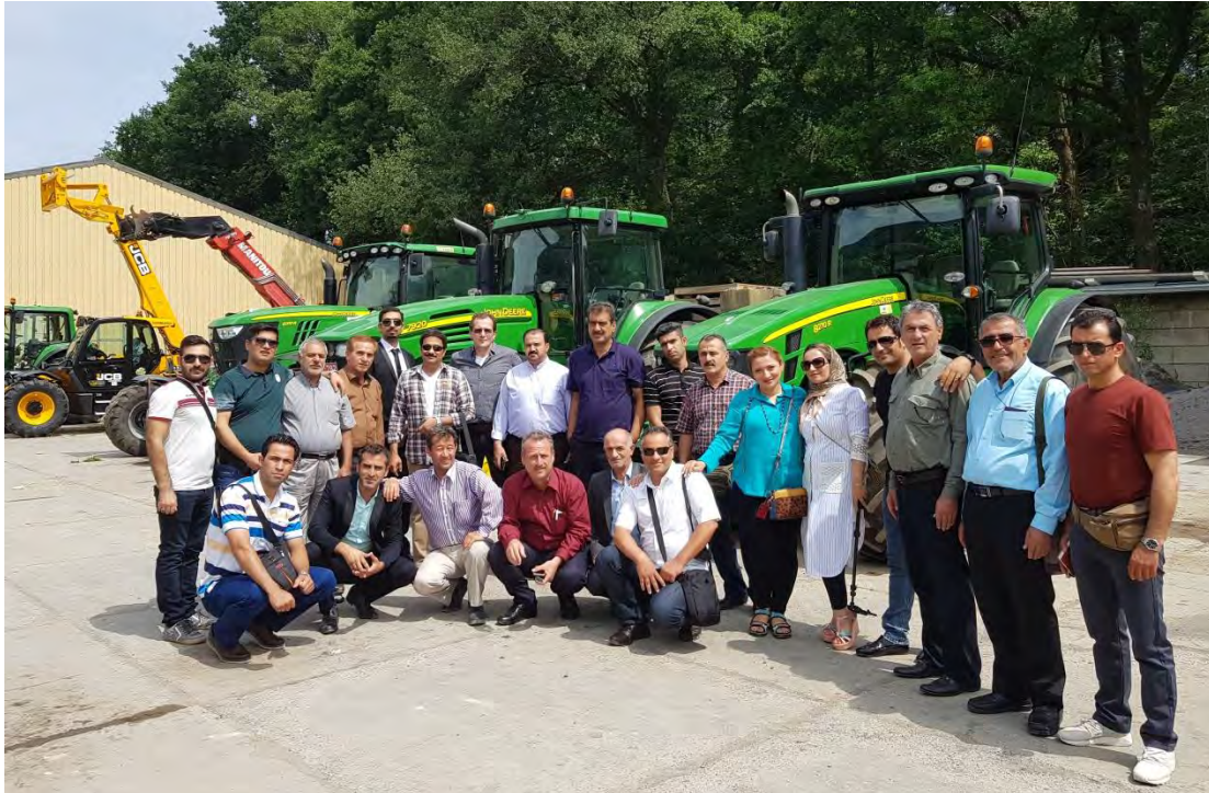
Visiting different types of machinery and equipment in the company while holding enquiry session about them