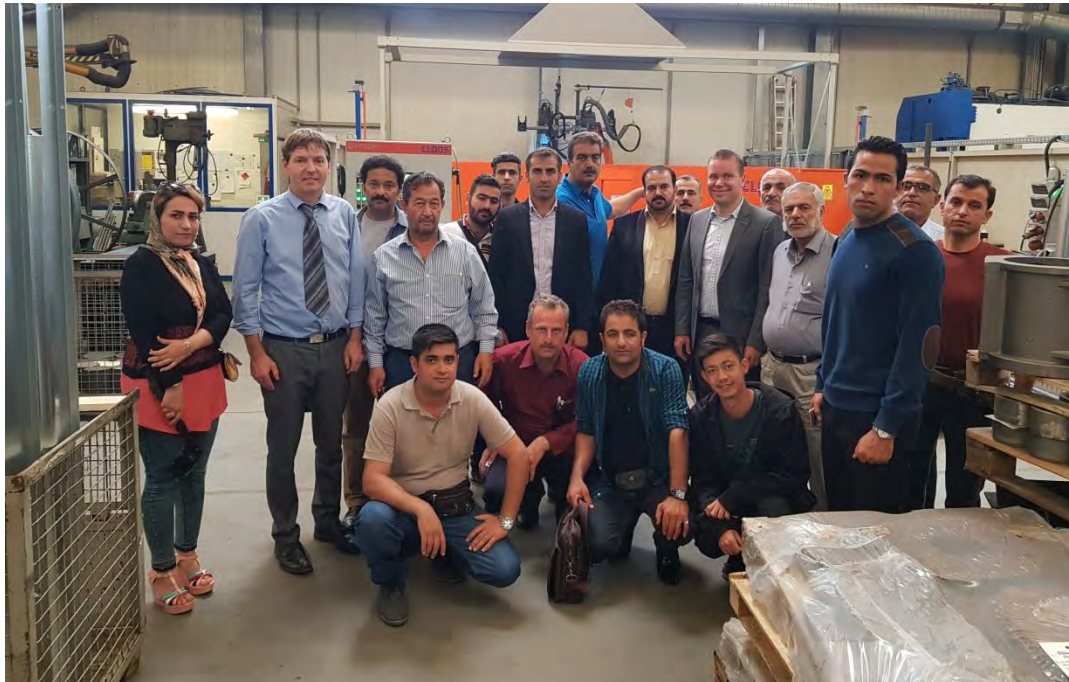
Factory Tour including machineries and equipment, welding robot, cutting and punching machine, etc.