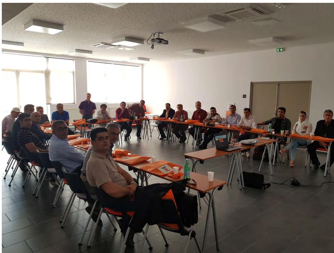
Giving primary presentation of the company, its history and performance in seed production, breeding and marketing