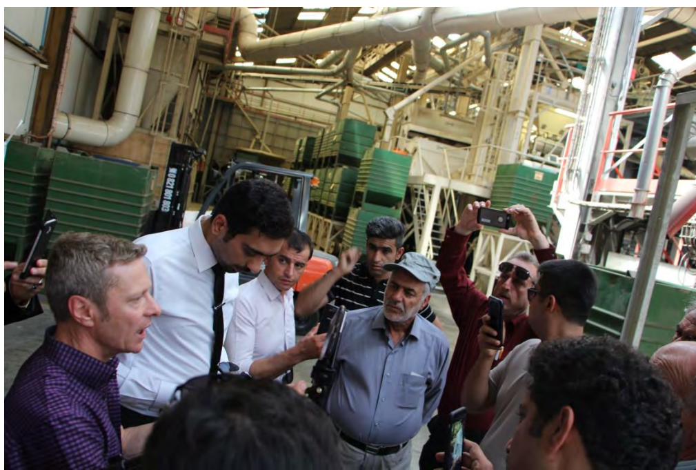
Visiting the plant, including machineries and equipment for processing and packing the seeds.