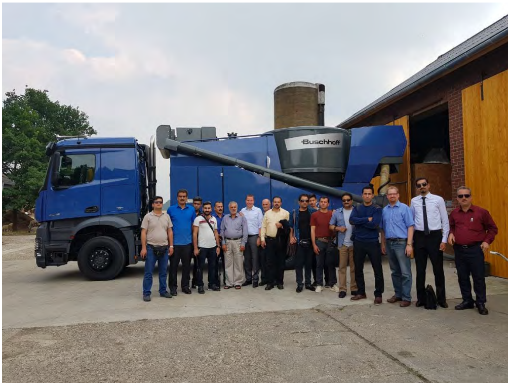
Visiting farm and mobile milling and mixing plant used for producing feed