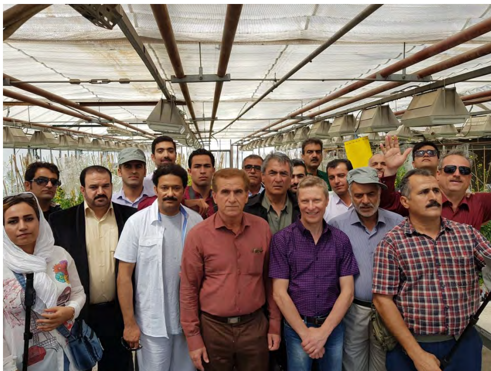
Visiting breeding activities in Rapeseed greenhouse