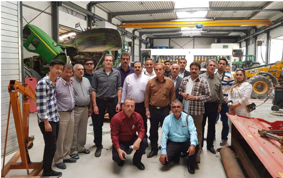
Visiting the company's workshop and equipment to be used for repair and customers' desired modifications